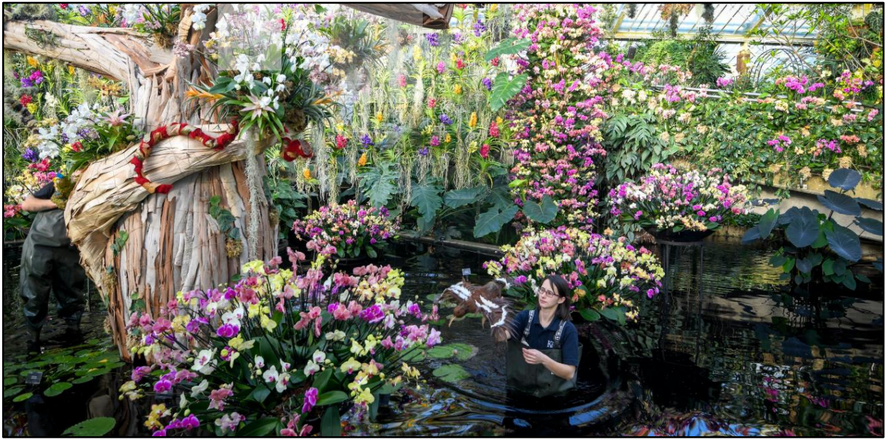
Kew Gardens, Richmond