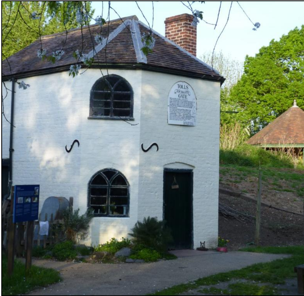
Avoncroft Museum of Historic Buildings