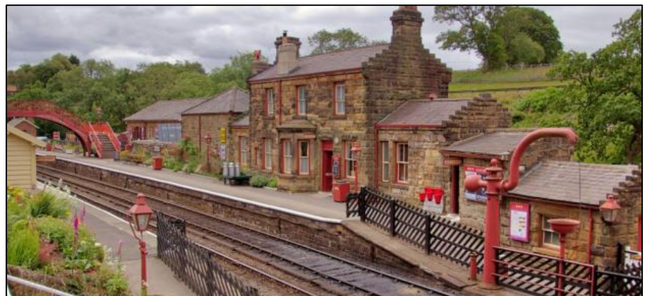
Day 4 – Whitby